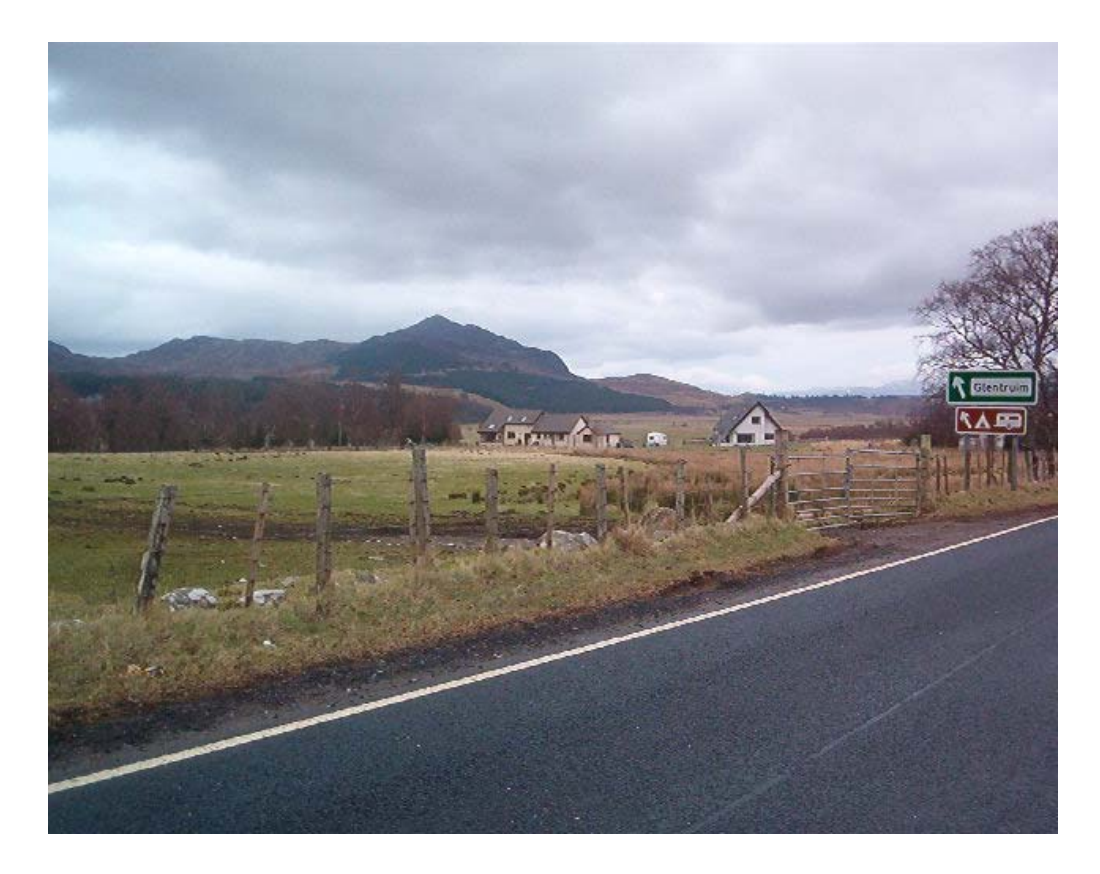
Fig. 5. Proposed alternative access directly of A889 looking eastwards towards existing houses – site within trees to the left hand side.