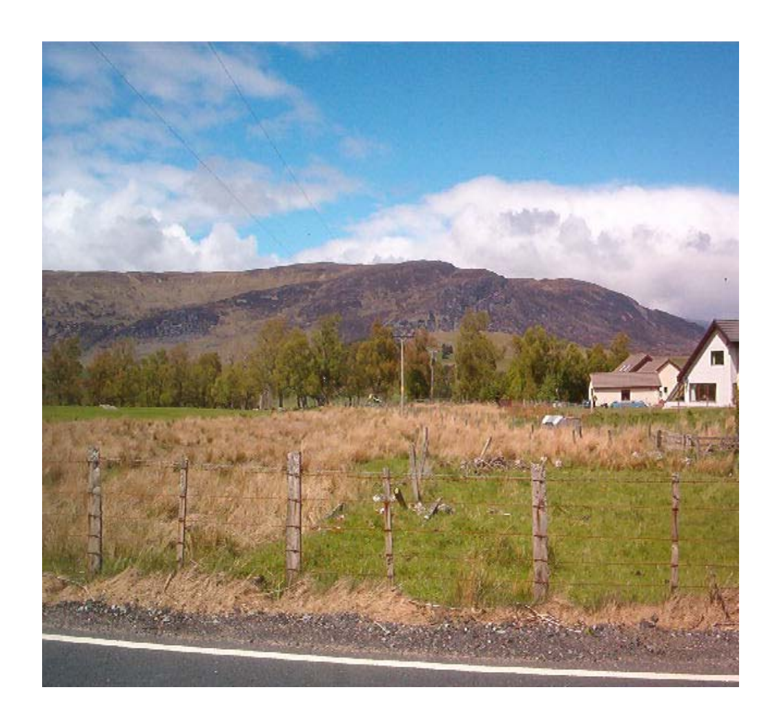
Fig.2. Site, within the trees when viewed from the A889

1. Catlodge is a group of houses which lies on the A889 Trunk Road from Laggan to Dalwhinnie, to the south west of Newtonmore. The site lies west of and immediately adjacent to the house known as Cnoc Nan Cruach which is one of 6 houses sited in a linear form on the north side of the trunk road (Fig.1.). The site comprises rough agricultural land and represents the eastern edge of an area of birch woodland which thins out at this point. To the north side open sloping fields extend down towards the River Spey. On the north side, between the site and the A889 there is a rough flat area of agricultural land. This provides an open setting to the approach to the houses at Catlodge from the west (Figs. 2 & 3).