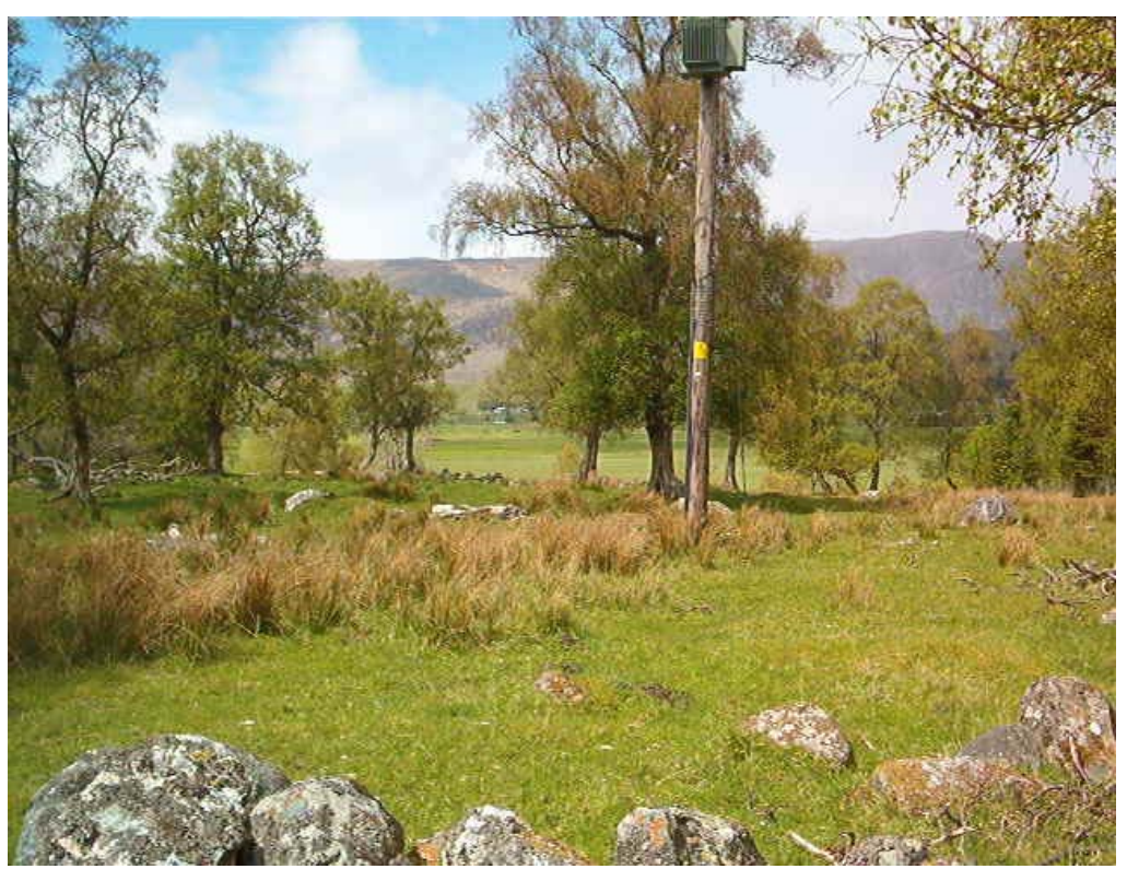
Fig.3. Site looking northwards